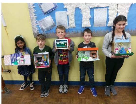
Our Story in a Box winners